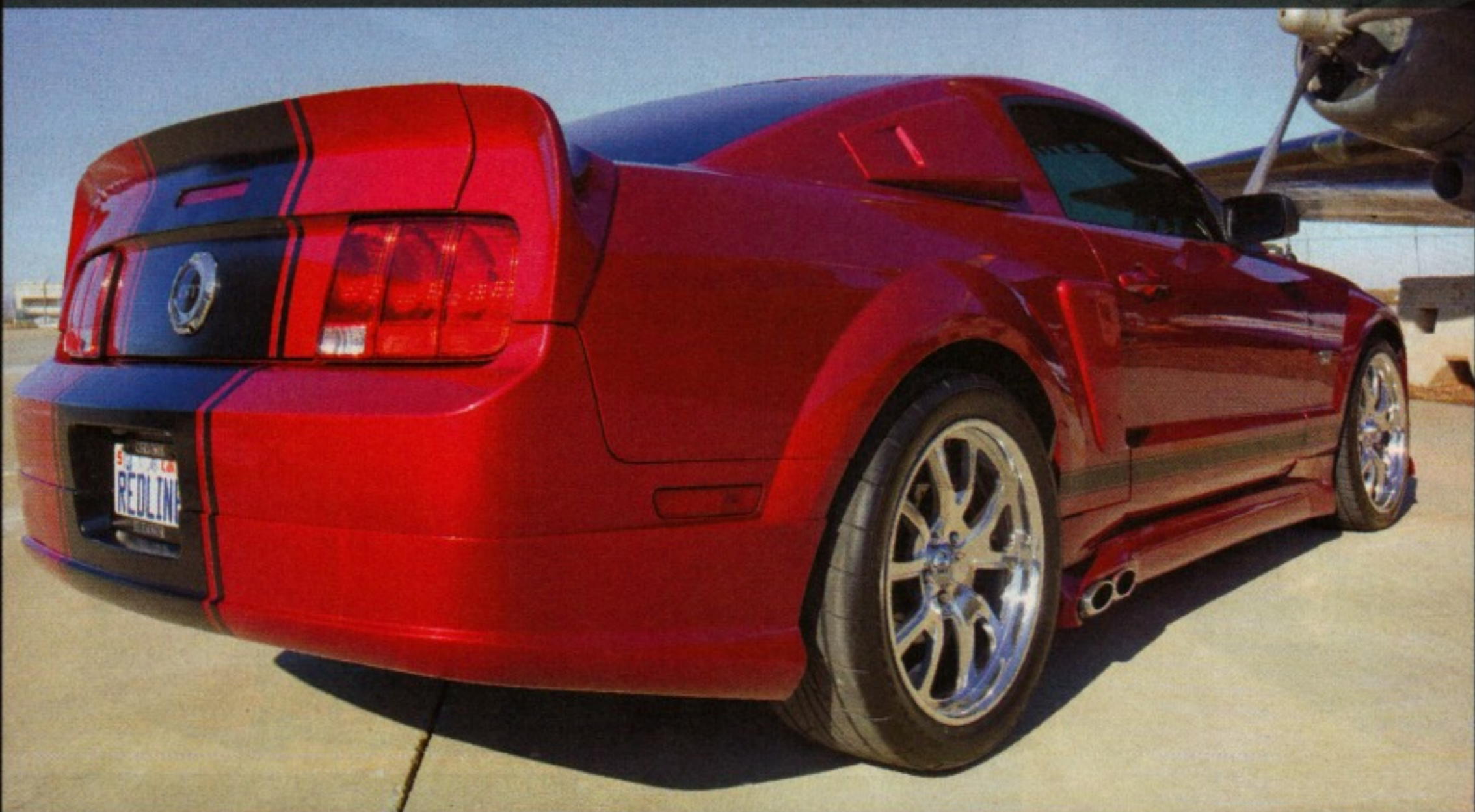
THE ELEANOR body kit from Cervini's adds to the classic retro look of this slick S197; the Super Snake stripes enhance the already aggressive appearance.

With classic looks and modern power, it's no surprise Lee's slick S197 is quite the showstopper! ///